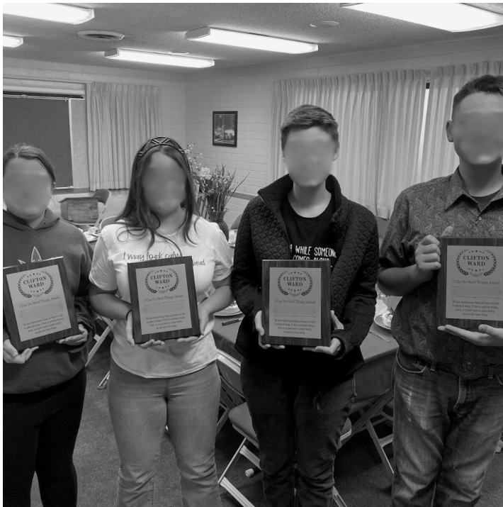
First wave of youth that accomplished their I Can Do Hard Things Challenge!