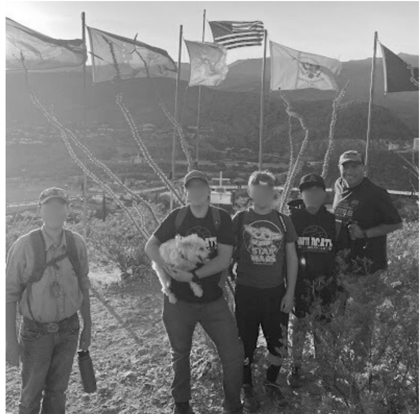
Young men finishing a hike.

These are lifetime sports that you can play long past your youth and school years. You need to learn how to and participate in any 4 of these games/activities. This can be signed off by a coach, parent, or leader.